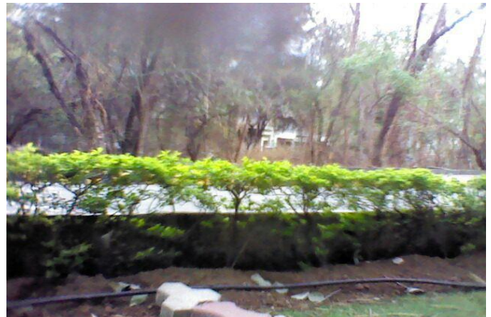
Fig. 3. Captured Image by the Spy robot

The bot captures images or videos as per the commands given by the raspberry pi. Figure 3 shows one such image captured by the bot. It is saved in the SD card which is being used throughout the working of the bot. As a result we can get real time information about the surroundings. The bot follows the path as instructed by the microcontroller board as discussed earlier. The path of the bot varies as per the presence of lines and objects in its way.